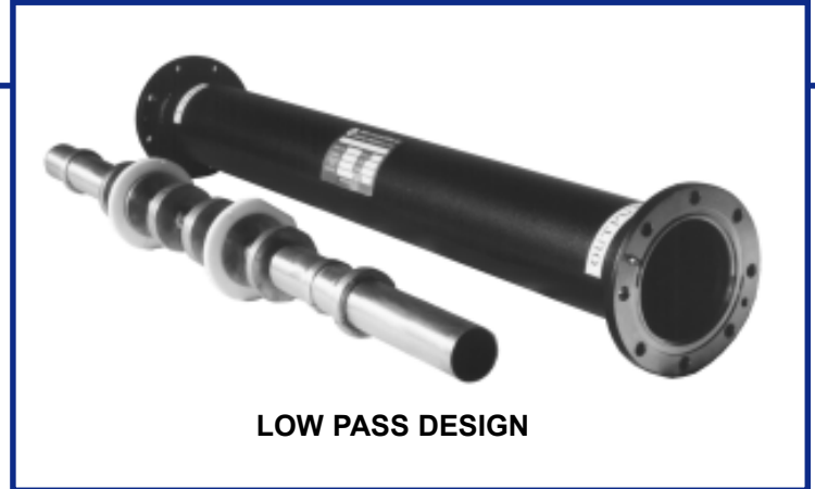
LOW PASS DESIGN