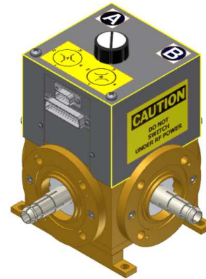
Model 61103, 4 Port 1-5/8EIA Shown

MCI Coaxial Transfer Switches are designed primarily for application in TV, AM, FM, UHF and other broadcast related areas. As four-port transfer switches, they will switch two signal sources between loads. Since they can also be used as SPDT switches, complex-switching matrices can easily be assembled.