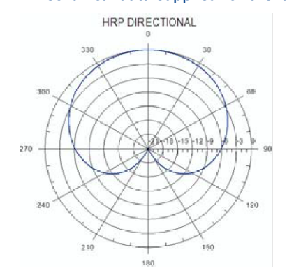
NOTE: Mechanical data supplied for the larger system, which corresponds to channel 2 FCC