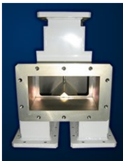
Folded Magic Tee