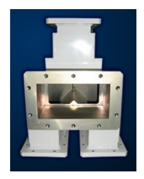
Folded Magic Tee