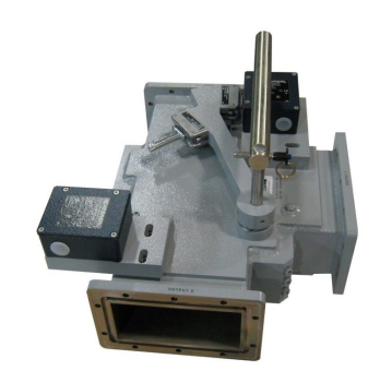
Shunt Tee Switch

Mega Industries WR975 Waveguide Switches are available in a variety of configurations, both manual and motorized operation. This line includes (1) waveguide shutters for personnel protection in multiple transmitter applications, (2) three-port patch link assemblies for infrequent, preplanned SPDT operations, (3) the conventional "T" configuration, for extremely high power use or where very high port isolation is required and (4) E-plane rotary transfer configuration for stand-by transmitters or matrix building elements.